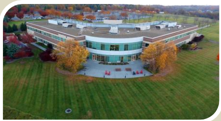
Health Professions Building 1775 N. Sector Dr. Winchester, VA 22601